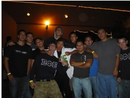
SigEp volunteers at the concert

The Cal Rho chapter of Sigma Phi Epsilon started the school year off by hosting our first annual Rock for a Cause benefit concert. The concert featured Los Angeles based rock band, A Static Lullaby, who was featured on this year's Van's Warped Tour. Other bands that opened for A Static Lullaby were, San Diego's, Kings to You as well as another Los Angeles