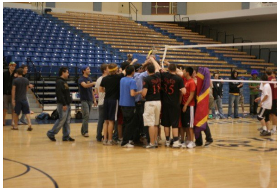
SigEp after its win over DSP

game in IFC Volleyball was completely astonished by SigEp's disciplined play and chapter support. The only colors they saw all game were purple and red. In less than 15 minutes, SigEp sent DSP back home to their books to study