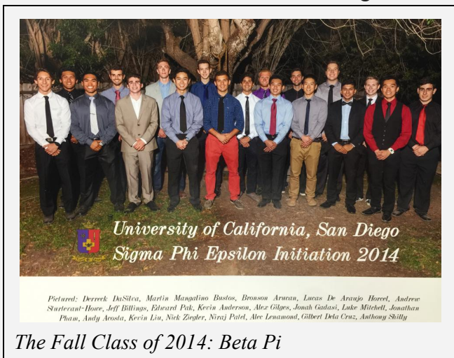
The Fall Class of 2014: Beta Pi