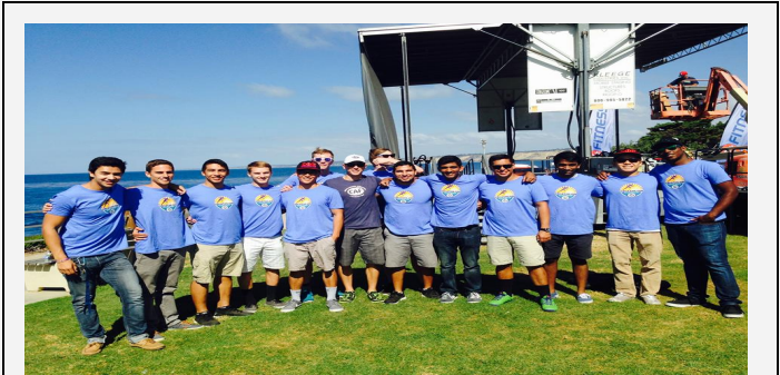
Brothers volunteering at the Triathlon Challenge