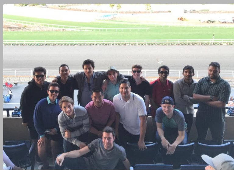
Some of our Brothers at the racetracks

On November 15 th of this year, the brothers of UCSD's Sigma Phi Epsilon chapter put on their polos to enjoy a bit of horseracing at the Del Mar race track. It was a beautiful and sunny Saturday, and with good spirits and friendly enthusiasm the brothers of Cal Rho cheered on the jockeys and horses through the nine races of the day. For many, it was the first time to ever have attended such an event. To add to the enthusiasm and cheering were prospects of fortune and glory to be obtained through the betting that many brothers chose to participate in. Unfortunately, these prospects were to remain unfulfilled, as winning bets on horses turned out to be much more difficult for complete novices than anticipated.